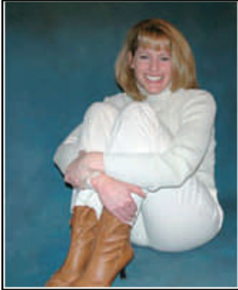
For her shoot we wanted to show off her gorgeous smile, and her gorgeous new boots!

Cosmetic Dentistry is our forte'. We have to thank all of our patients who entrust us with the awesome responsibility of enhancing their smiles. We also have a lot of fun, when we get done, in our portrait studio up in the attic of the building. Here then, are two recently completed smiles, and the thank you letters that the patients added to their portraits.