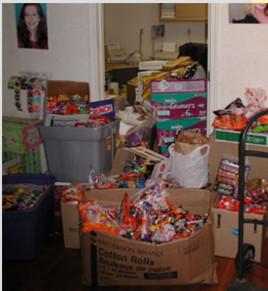
the children of those two nations. The candy is used to bribe them to foster relations and trust.

While you may wonder why we would want to send candy to our men and women in harms way, and a great distance from the most competent dentistry in the world, the purpose is to promote good feelings about our country with