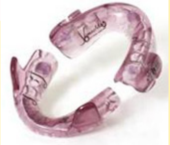
The SomnoMed Appliance