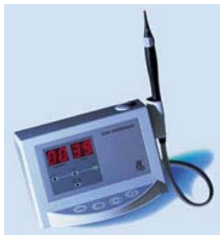
The Diagnodent Laser.

The drawback to this is that one never knows whether the hook is sharp enough to enter the small fissure on the biting surface of the tooth to find the decay.