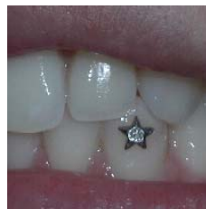
Michele opted to have a Swarovski crystal placed.

We can place them almost anywhere on natural teeth (not available on crowned-teeth).