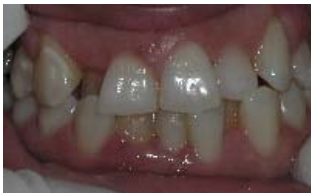
Severe crossbites on both laterals