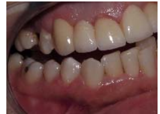
Natural All Empress Porcelain